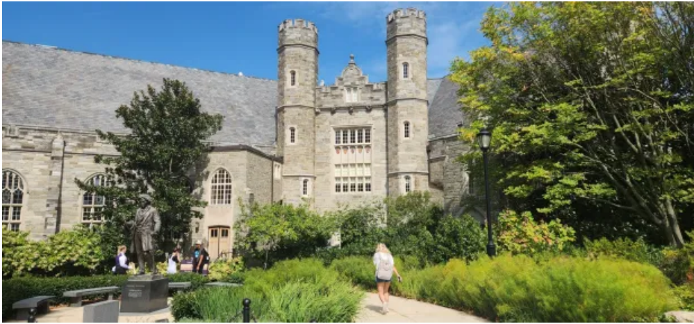
Picturesque West Chester University.

The new president said she wants to create a shared vision through a mutual listening tour.