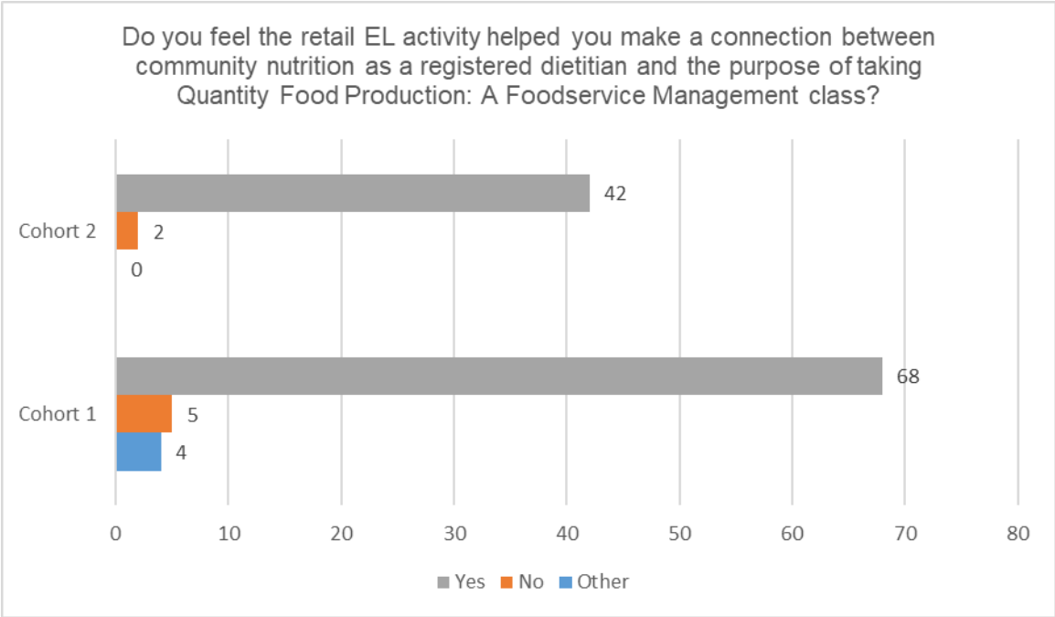
Figure 4. Student perceptions on course connection to retail EL.