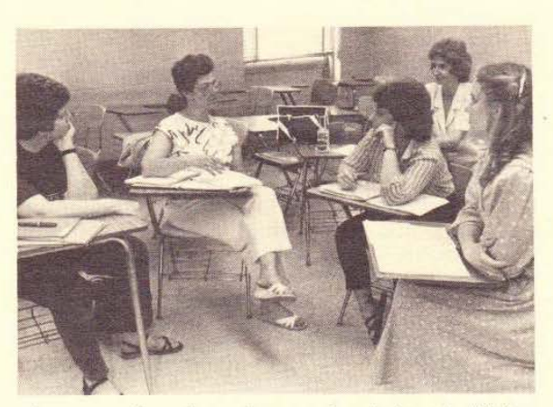
A group of teacher-writers confer during the Writers Workshop.

writing as a process. The individual workshops demonstrated successful methods and strategies involved in the teaching of writing including such topics as: teachers as writers, prewriting strategies, implementation of the writing process, revision strategies, and the reading/writing connection.