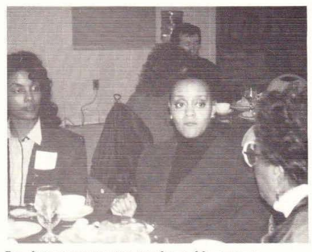
Pre-dinner conversation involves table partners.