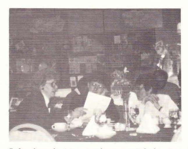
Before dinner begins, serveral participants look over an earlier handout.