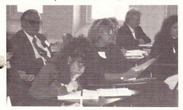
Participants read a selection from Cisneros' The House on Mango Street

Finally, Blau pointed out that as people grow they revise their interpretation of the world, of the text of life.