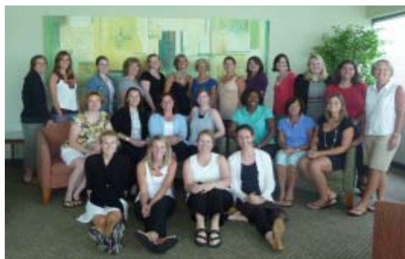
New PAWLP Fellows, Class of 2010