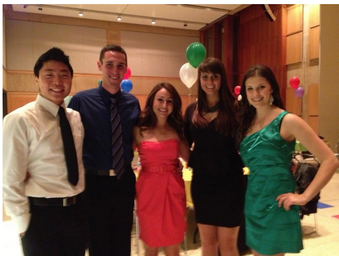
Members of the 2013-2014 Exec Board

to better the organization. I am so honored to have worked with all of you. To the committee chairs, you should be very proud of yourselves. The many components of HSA would not be able to function without you. You have contributed so much time to your different committees and have done excellent work. To the members of HSA, you made the ideas of the Exec Board and the Committee Chairs come to life. There would not be an organization if it were not for you showing up to meetings and different service events.