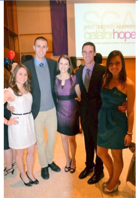
Members of the 2012-2013 Exec Board

This year could not have been an enormous success without the help of my peers. To my Executive Board, you all rock. You sat through those long meetings every week and contributed your time, energy and plethora of creative ideas to see the organization grow. Your dedication to the organization clearly showed while working efficiently with each other