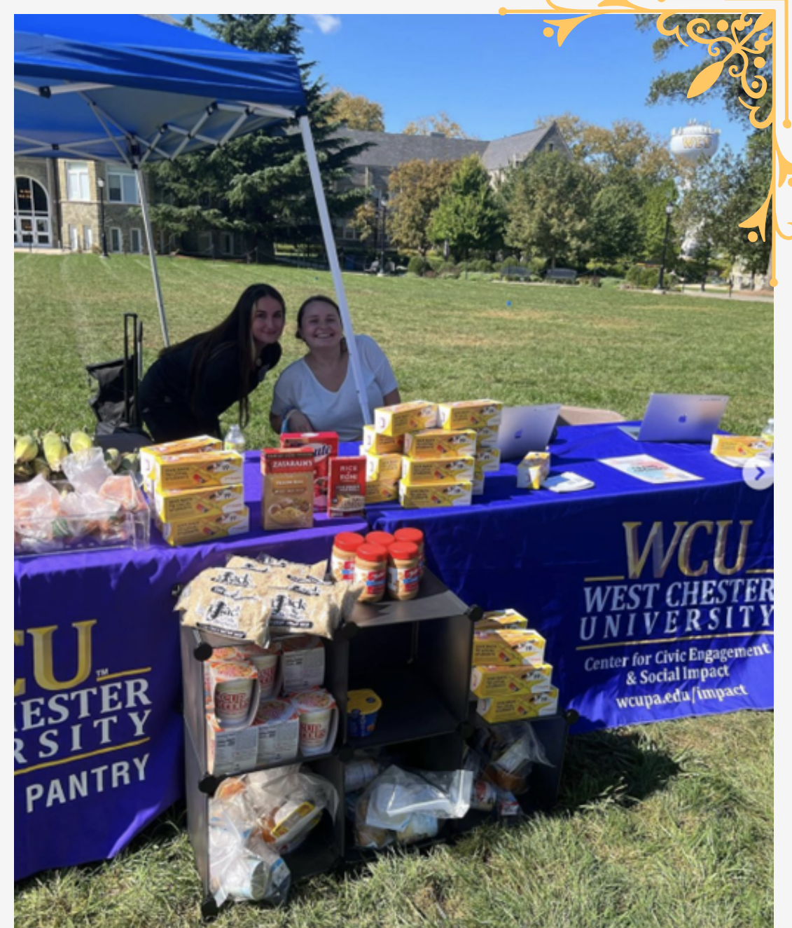
Resource Pantry Pop-Up event on the quad