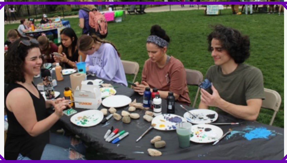
Artists of West Chester table at the P.E.A.C.E. Carnival