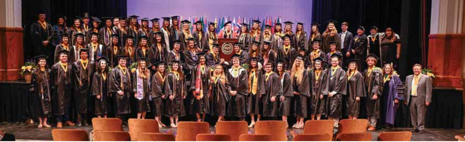
Honors College commencement, May 2022