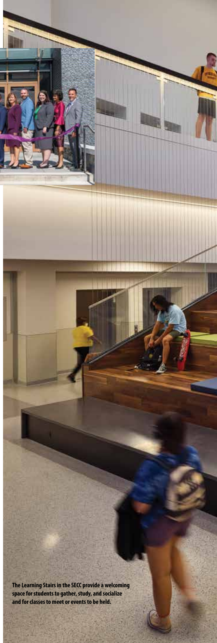
The Learning Stairs in the SECC provide a welcoming space for students to gather, study, and socialize and for classes to meet or events to be held.