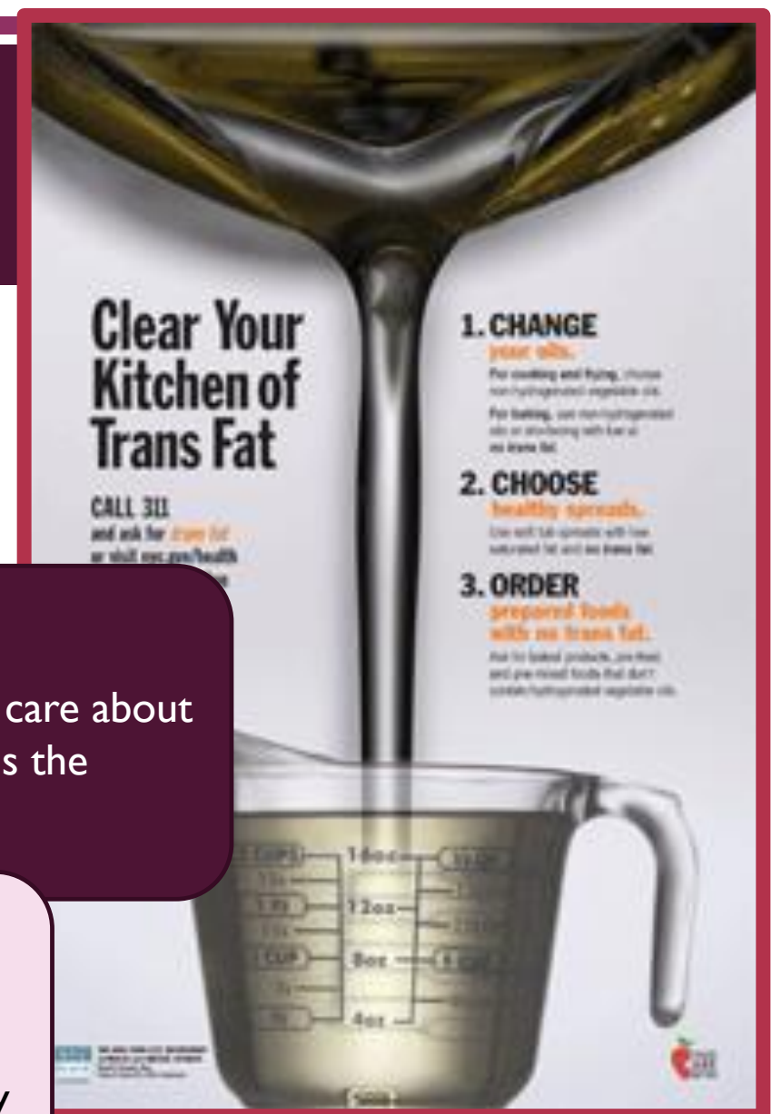
Image from NYC DOH webpage: <a href="http://www.nyc.gov/html/doh/html/pr/pr083-05.shtml">http://www.nyc.gov/html/doh/html/pr/pr083-05.shtml</a>

Pamela from NJ shared, "Working in the city coupled with commuting... My family is forced to buy prepared foods for a good portion of our meals and snacks...who has the extra time, energy or funds to do the research necessary to find the good stuff?"